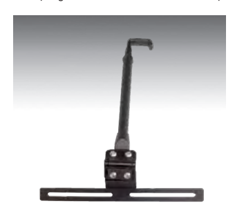
Screen Support - A-Mod

Computer securing system uses Kensington locking system. Fasten security cable to permanent structure in whice