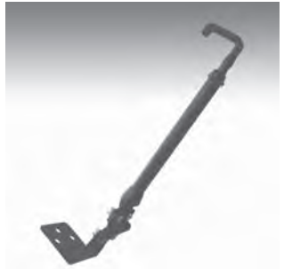
Screen Support - Acd

The Brace Kit attaches to the stand providing additional support. It can be adjusted in length and mounts to flat, vertical or angled surfaces.