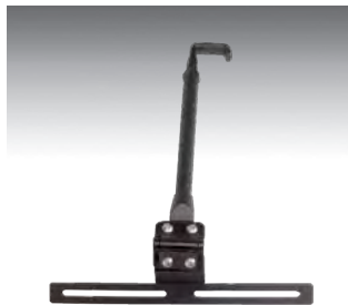
Screen Support - A-Mod Model 450-0449

Computer securing system uses Kensington locking system. Fasten security cable to permanent structure in vehicle.