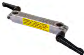
Straight Arm 425-3062