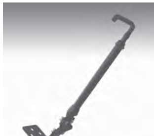
Screen Support - Acd 425-5999

The Brace Kit attaches to the stand providing additional support. It can be adjusted in length and mounts to flat, vertical or angled surfaces.