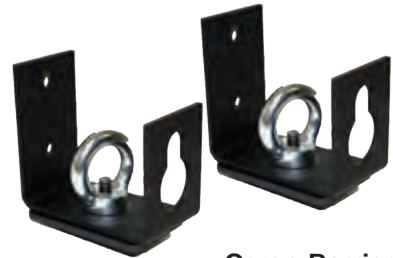
Cargo Barrier Brackets with Tie Downs (Set of 2) 410-9888