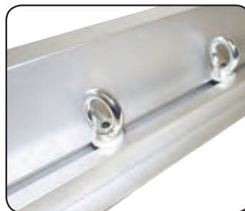
Tie Downs Installed

Easy installation - Both the Tie Downs and the Cargo Barrier Brackets are designed to use an existing location on slide as mounting point.