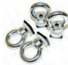
Tie Downs (Set of 4) 410-9887