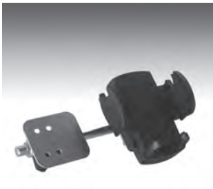
Pivoting Cell Phone Holder 425-5299

Specifications subject to change without notice.