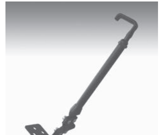
Screen Support - Acd

The Brace Kit attaches to the stand providing additional support. It can be adjusted in length and mounts to flat, vertical or angled surfaces.