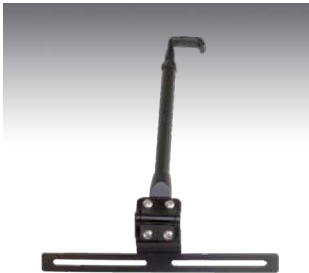
Screen Support - A-Mod

Computer securing system uses Kensington locking system. Fasten security cable to permanent structure in vehicle.