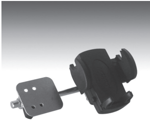
Pivoting Cell Phone Holder

Specifications subject to change without notice.