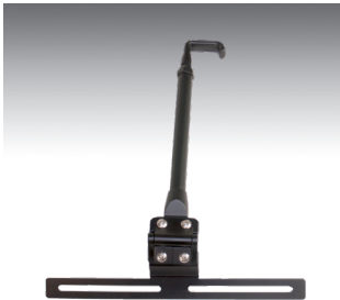
Screen Support - A-Mod

Computer securing system uses Kensington locking system. Fasten security cable to permanent structure in vehicle.