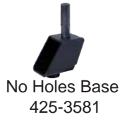
No Holes Base 425-3581