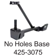
No Holes Base 425-3075