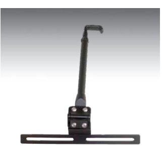
SCREEN SUPPORT - A-MOD

Computer securing system uses Kensington locking system. Fasten security cable to permanent structure in vehicle.