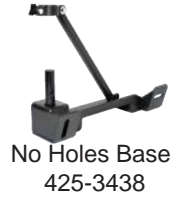
No Holes Base 425-3438