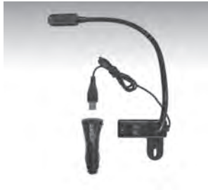
USB Light 425-2490

Allows you to tilt your phone independent of the desktop angle. Mounts to side of 10" x 12" Desktop.