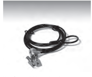
Kensington® Masterlock® 425-1317

12" flexible wand with blue LED's and rheostat to adjust brightness. Three foot power cord plugs into cigarette lighter.