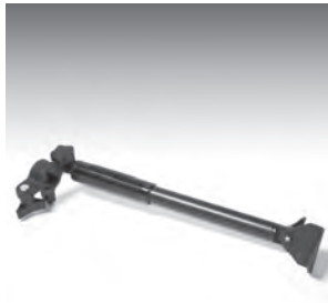
Brace Kit 425-5238

The Screen Support is designed to keep your screen in place while you use your computer. It attaches directly to the A-MOD Desktop and adjusts in height and tilt angle.