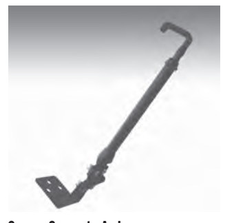
Screen Support - Acd

The Brace Kit attaches to the stand providing additional support. It can be adjusted in length and mounts to flat, vertical or angled surfaces.