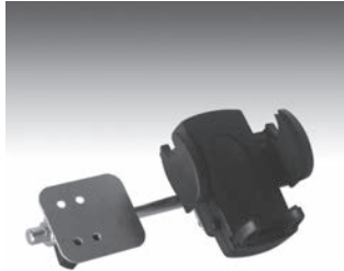
PIVOTING CELL PHONE HOLDER

Specifications subject to change without notice