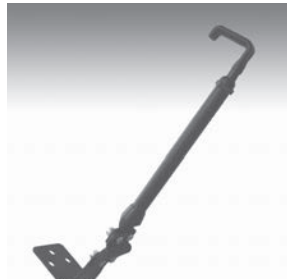
SCREEN SUPPORT - ACD

The Brace Kit attaches to the stand providing additional support. It can be adjusted in length and mounts to flat, vertical or angled surfaces.