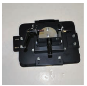
Flip mounting station over onto face.