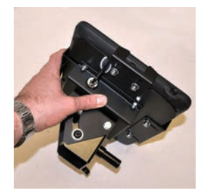
Lock your mounting station.