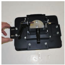
Move all adjustments on Mounting Station to make a snug fit onto tablet.