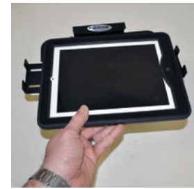
Place your tablet into Mounting Station.