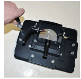
Tighten all locknuts.