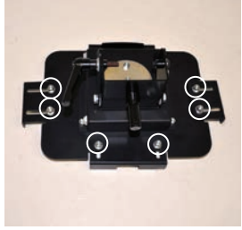
Loosen locknuts on back of Mounting Station.